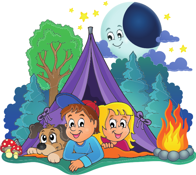
Sleep in a tent