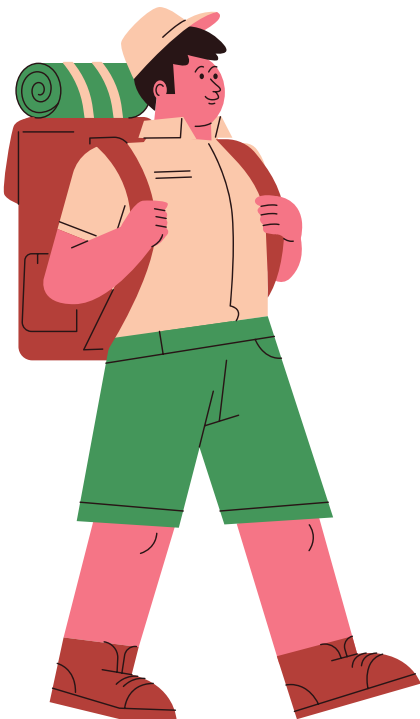
Go on a hike