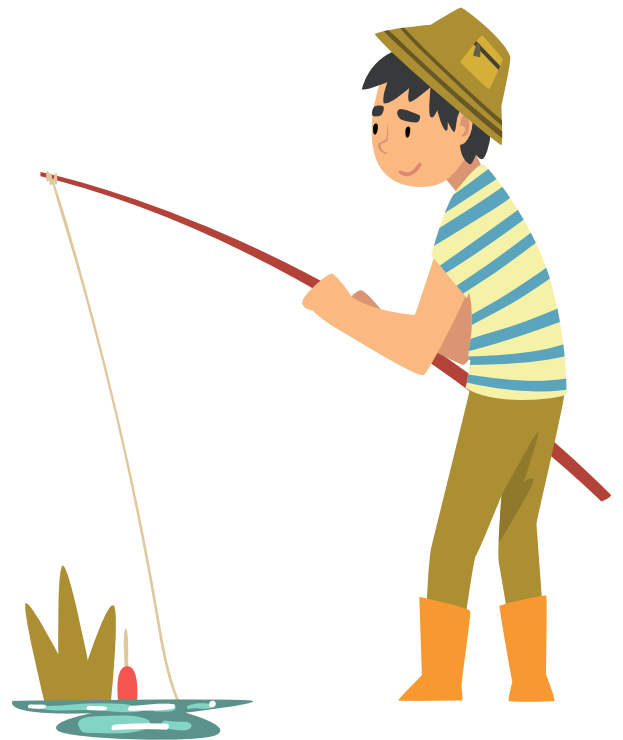
Fish in a lake